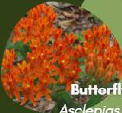
Butterflyweed Asclepias tuberosa