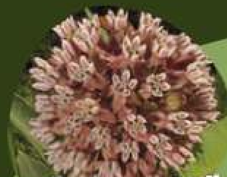
Common Milkweed Asclepias syriaca