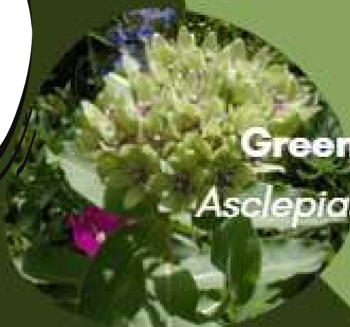
Green Milkweed Asclepias viridis Walter