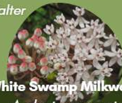
White Swamp Milkweed Asclepias perennis

The toxins in the Milkweed leaves are ingested and absorbed making Monarchs less tasty to predators!