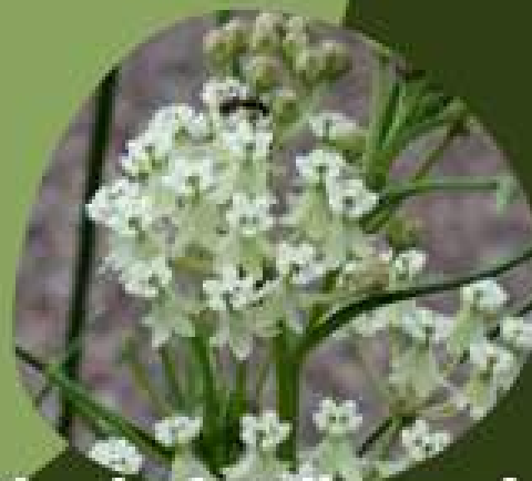
Whorled Milkweed Asclepias verticillata