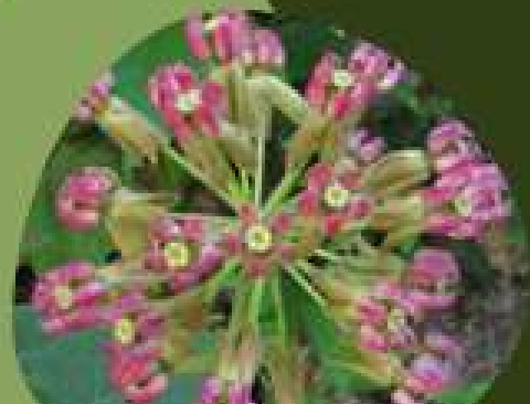
Clasping Milkweed Asclepias amplexicaulis