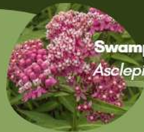
Swamp Milkweed Asclepias incarnata